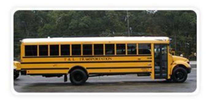
Type D School Vehicle